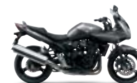
Metallic Thunder Gray (YLF)

Specifications, appearance, colors (including body color), equipment, materials and other aspects of the "SUZUKI" products shown in this catalogue are subject to change by Suzuki at any time without notice, and they may vary depending on local conditions or requirements. Some models are not available in some regions. Each model may be discontinued without notice. Please inquire at your local dealer for details of any such changes.