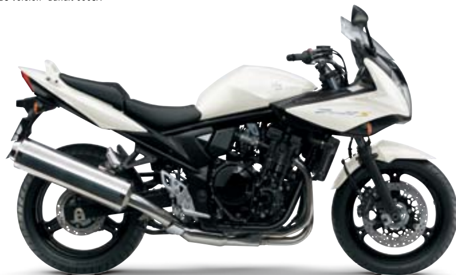
Photo : Bandit 650S