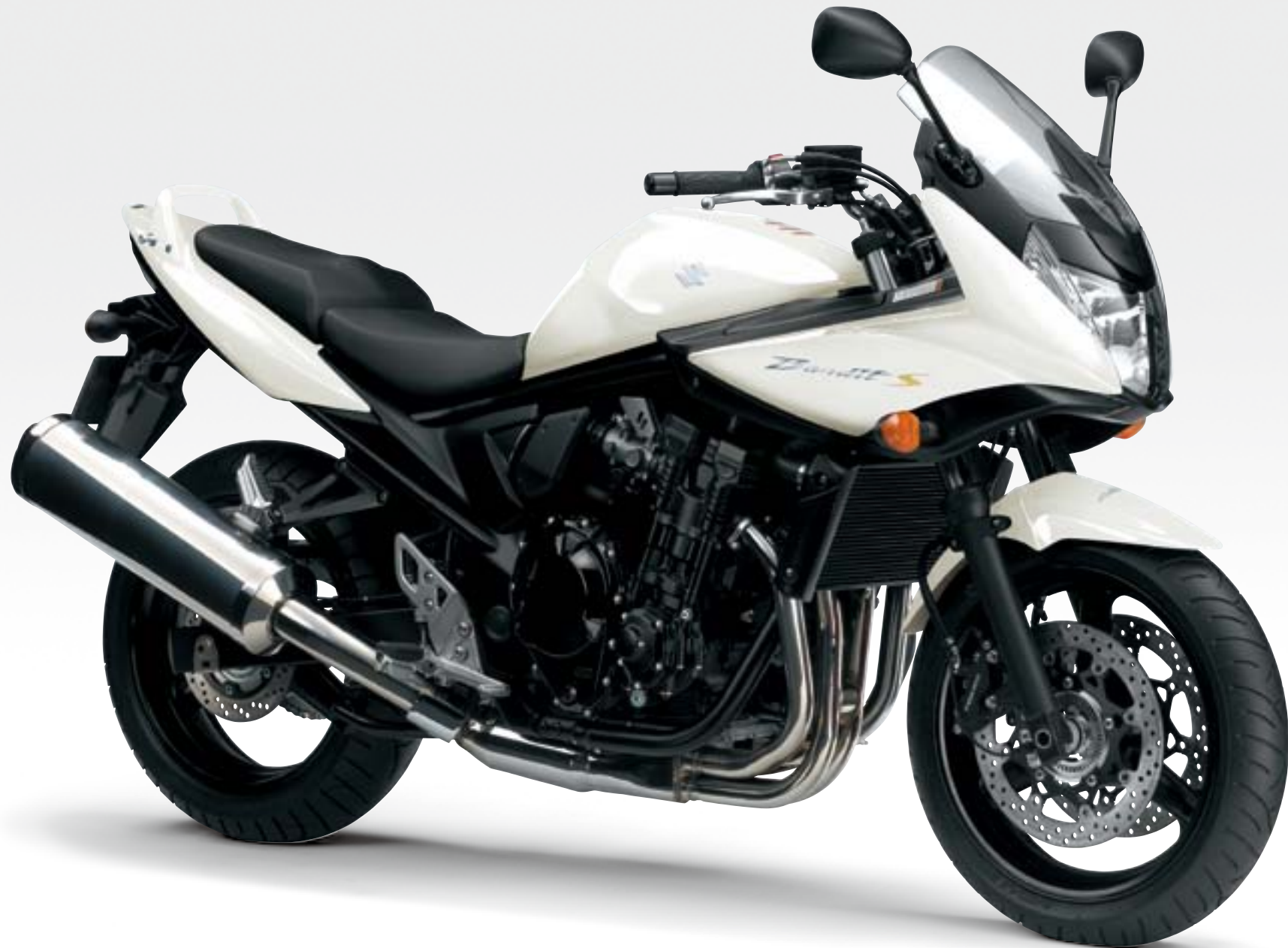
Photo : Bandit 650SA