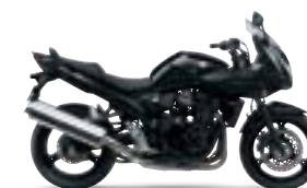
Pearl Nebular Black (YAY)