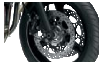
ABS* (Bandit 650SA only)